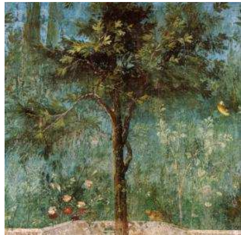
Villa of Livia. Principate