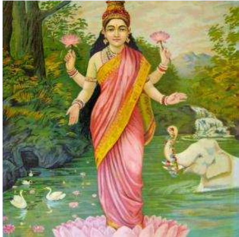
Lakshmi. 19th century