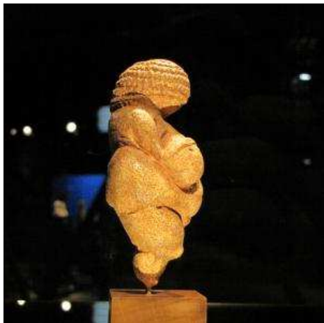
Venus of Willendorf. 275th century BCE