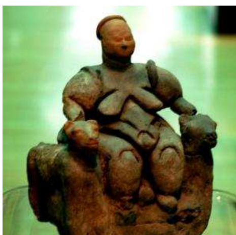
Mother goddess. 60th century BCE