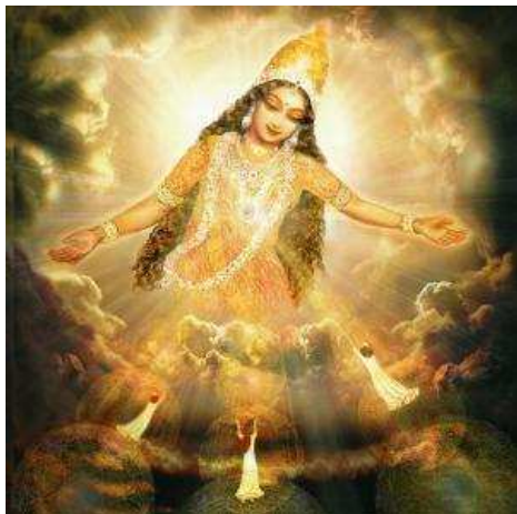
Adi Shakti. 21 century