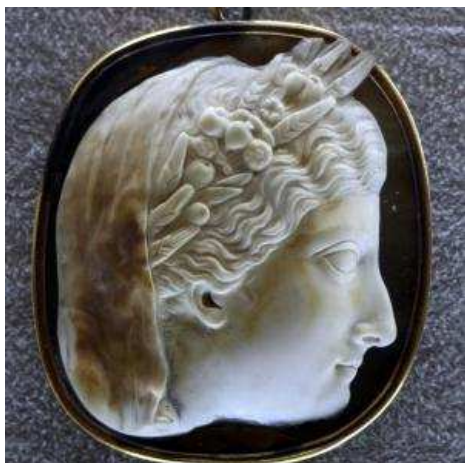
Ceres. 1st century