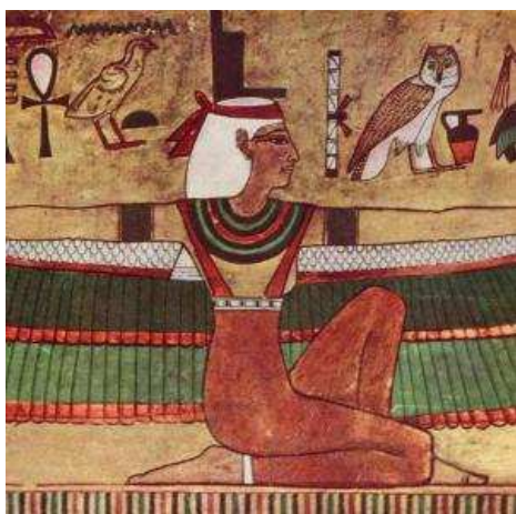
Isis. 14th century BCE