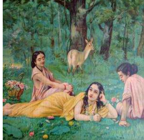
Shakuntala by Ravi Varma