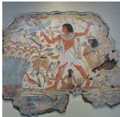
Hunting in reeds. New Kingdom