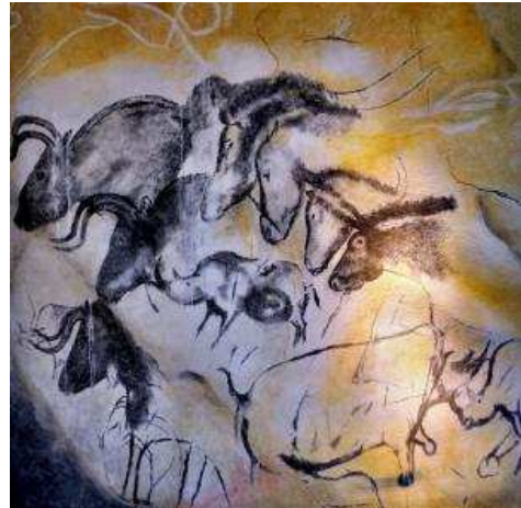
Chauvet Cave. Aurignacian

Hail, Mother of the gods, wife of starry Heaven; freely bestow upon me for this my song substance that cheers the heart! And now I will remember you and another song also.