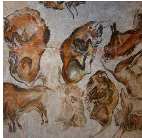
Cave of Altamira. Magdalenian