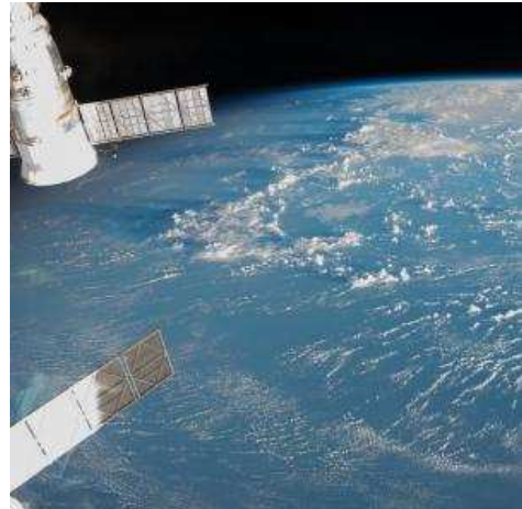
Earth April 1, 2015